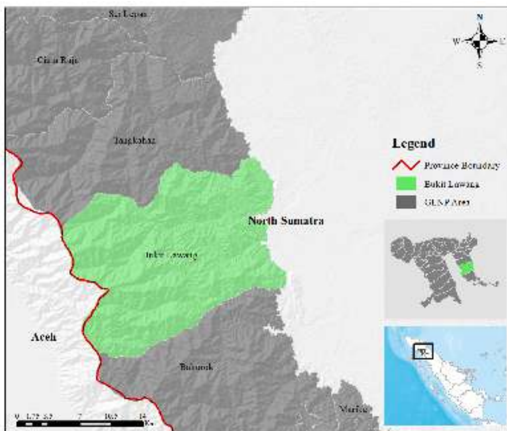
Figure 1. Study area of Bukit Lawang Forest of Gunung Leuser National Park

This research was conducted in Bukit Lawang forest as part of Gunung Leuser National Park (Figure 1) in North Sumatra from November 2017 to April 2018. Bukit Lawang Forest is the first orangutan rehabilitation station in Indonesia that was established in 1979 [1, 2].